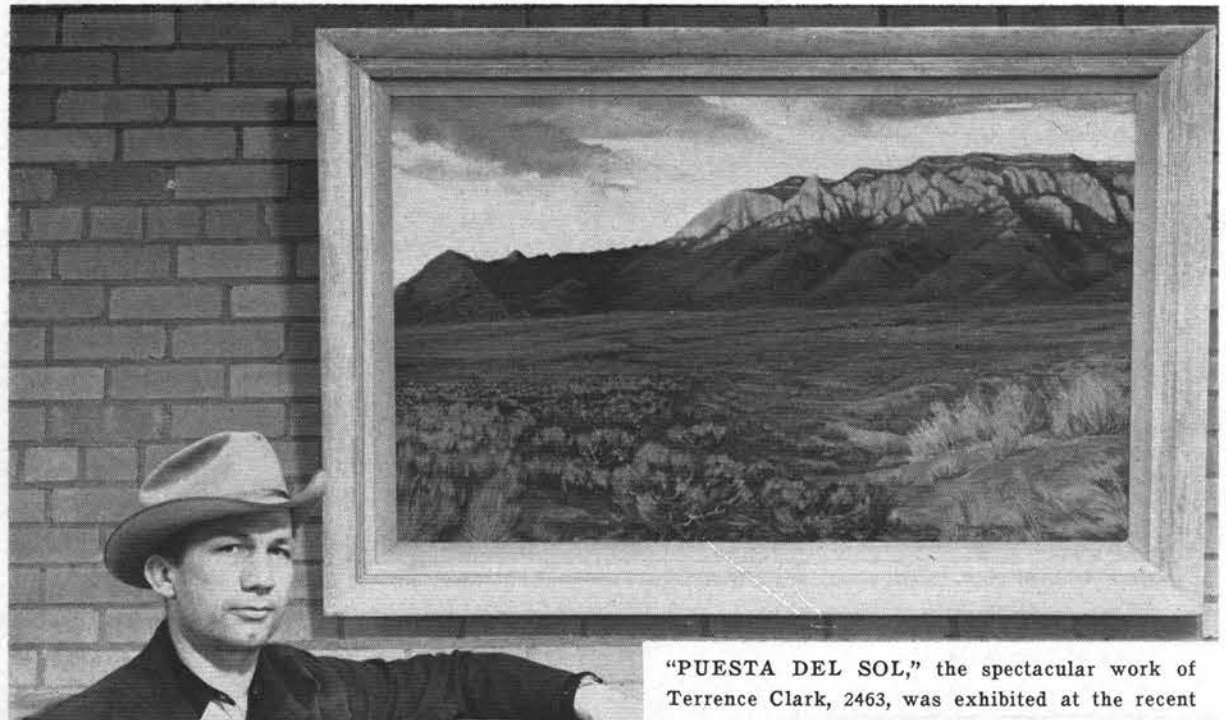
Coronado Club Art Exhibit.

The meeting will be in conjunction with the UNM IRE student branch and will be in Room 2, Mechanical Engineering Bldg.